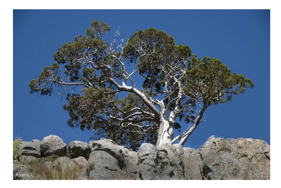
Fig. 1. The Clanwilliam cedar in habitat.

methyl ether, acetyl cedrene, Virginia cedarwood is used in cosmetic formulations, soaps, perfumes, aftershave lotions (FAO, 1995; Schreiber, 1996). It was also noted that cedarwood oil is used in combination with other substances as a homeopathic remedy and marketed as a vaporizing ointment for skin application. We here provide the first analysis of this iconic species which occurs at an altitude of 2000 m on the Cedarberg Mountains and compare the essential oil composition with some commercial cedarwood oils.