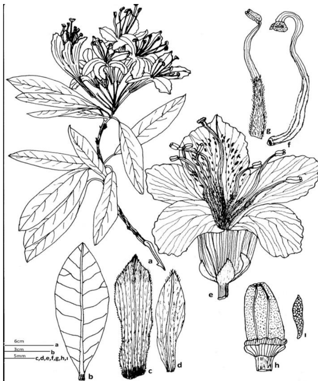
Figure 1. Rhododendron ponticum subsp. ponticum . a—plant; b—leaf; c-- bracts; d—bracteols; e-- flower; f-- pistil; g-- stamen; h-- capsule; i-- nutlets.

Rhododendron ponticum subsp. ponticum (Figure 1) is a large shrub, to 10 m Stem with variable indumentum when young, but not tomentose, glabrous-glandular; terminal bud ca. 1.5-2 cm. Petiole 1-1.7 cm, glabrous-glandular; lamina elliptic-obovate, 6-12.5×2-4.5 cm, base acute, margin repant-integer, obtuse-acute at apex, coriaceous, glabrous-glandular hairs, fine venation usually flat above.