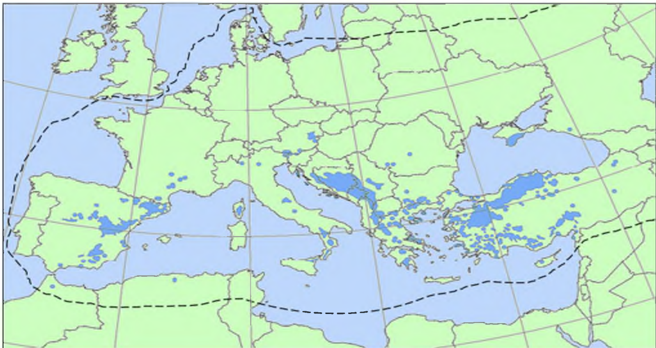
Fig. 1 The studied natural populations of Pinus nigra (Arn.) and the principal edges of genetic diversity determined by the BARRIER program ( dashed line ) and the model-based method of STRUCTURE/TESS programs ( solid line ) according Naydenov et al. (2016) on the top. The present natural distribution of the European Black Pine ( blue polygons ) according EUFORGEN; the dashed line is the probable

limit of the area of distribution of the ancestors of the European Black Pine ( Pinus thomasiana Goepp. and Reich; and Pinus laricioides Menzel) in the Tertiary epoch (i.e., Eocene, Oligocene, Miocene and Pliocene) according the paleobotanical artefacts (Stefanov 1941/1942, 1943; Gorbunov 1958; Dijkstra 1973; Palamarev 1989; Arslan et al. 2012; Ehrendorfer 2013). (Color figure online)