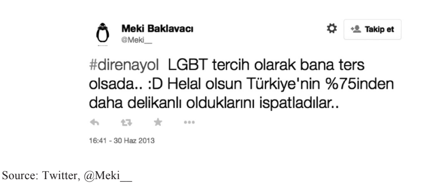
Figure 5. #direnayol example [#direnayol lgbt is not for me but... :D Bully for them for proving they're more delikanlı from 75% of Turkey]

It is remarkable that in Twitter, some heterosexuals who used the hashtag #direnayol characterized LGBTIS as delikanlı due to GPP, which means «young and strong man».