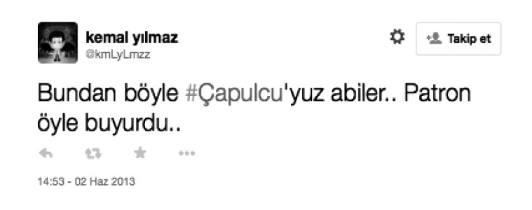
Figure 1. #çapulcu example [I love the name! #capulcu! #bençapulcuyum]