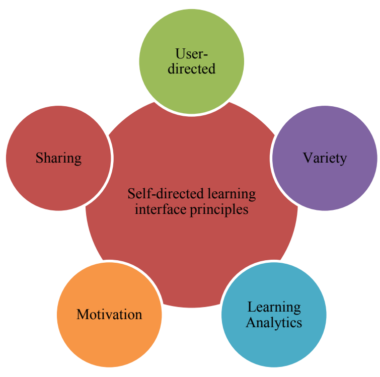
Figure: 3 Interface design principles for self-directed learning