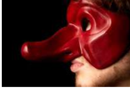
Figure 1. Zanni, Date of Access.