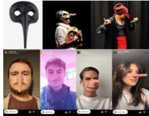
Figure 2,3,4. Zanni.

/Figure 2, 3, 4/: Unnamed Zannis are known for their long noses. The longer the nose of their mask, the more stupid the character becomes. Long nose effects, which are used to obtain funny results in face changing applications, are quite common.