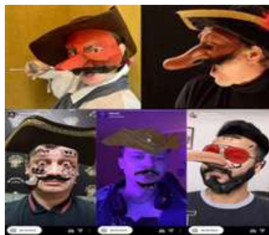
Figure 11,12. Capitano.

Similar Characteristics of Face Changing Applications and Commedia Dell'Arte Masks / Figure 11, 12/: Capitano's mask has a long nose. Capitano's hat and feather, depicted with his eyebrows and mustache, are other characteristics he has. The image of the captain is often included in face changing applications. The use of a mustache and a large type of hat reinforces the connotation of the captain.