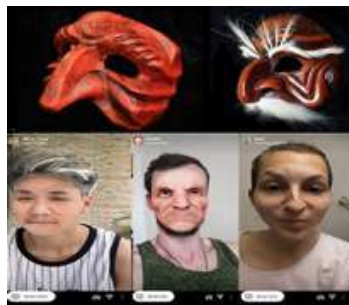
Figure 7,8. Pantalone.

Similar Characteristics of Face Changing Applications and Commedia Dell'Arte Masks / Figure 7, 8/: Pantalone, who is in the old comic group of Commedia Dell'Arte types, has a hook-like nose and lush white eyebrows. On his mask, lines emphasizing his old age are drawn, -sometimes- he is depicted with a moustache. We encounter hook nose and aging effects in the form of the comic, which is obtained with applications with face changing software.