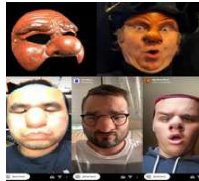
Figure 9,10. Dottore.

Figure 9, 10/: Unlike other masks, the Dottore mask is a mask that covers the forehead and nose leaving – often – the cheeks open. Dottore can be easily distinguished from other types with his nose that looks like a ball. We also come across round swollen noses in the form of comic obtained with applications with face replacement software.