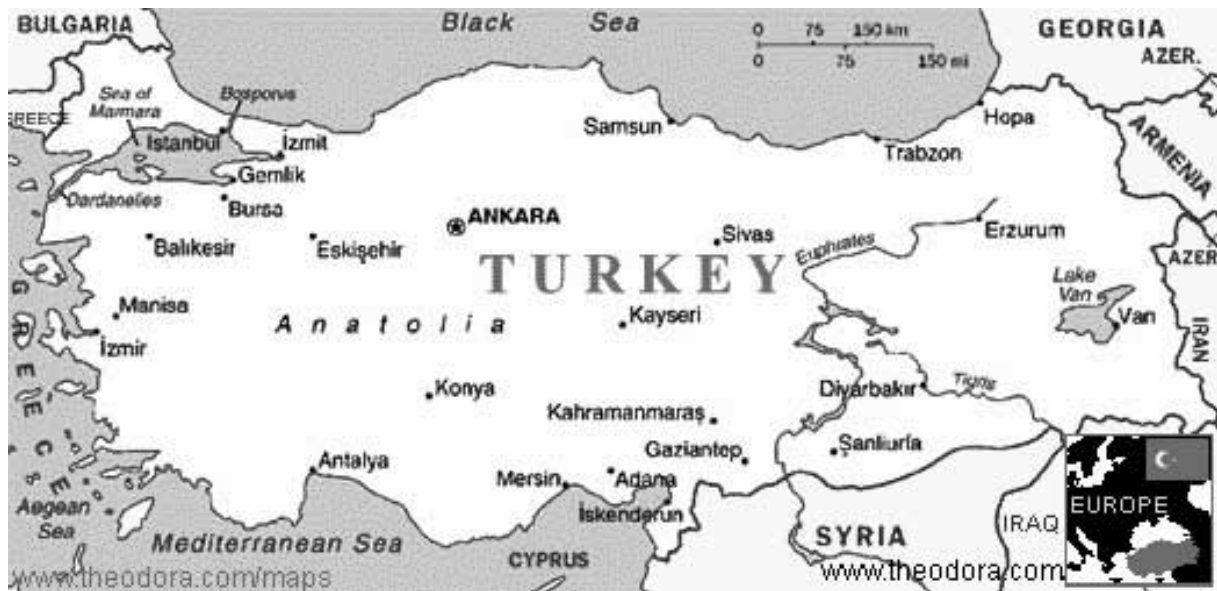
Map 1. Turkey and Erzurum