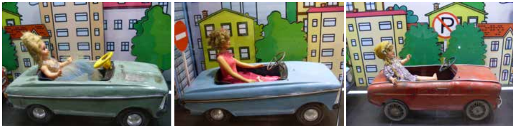
Figure 19,20,21: Miniature Car, Train Samples, Bursa Tofaş Turkish Car Factory. Art Galery Toy Exhibition, (Photo by Elij Gönül)