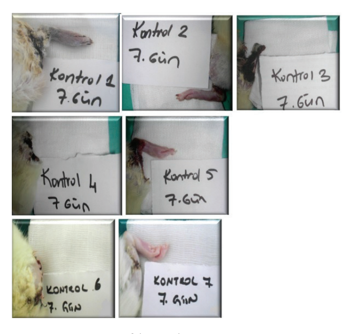
Figure 2. Macroscopic view of the control group.

The results of the study group was statistically and significantly different compared to the control group (p<0.05).