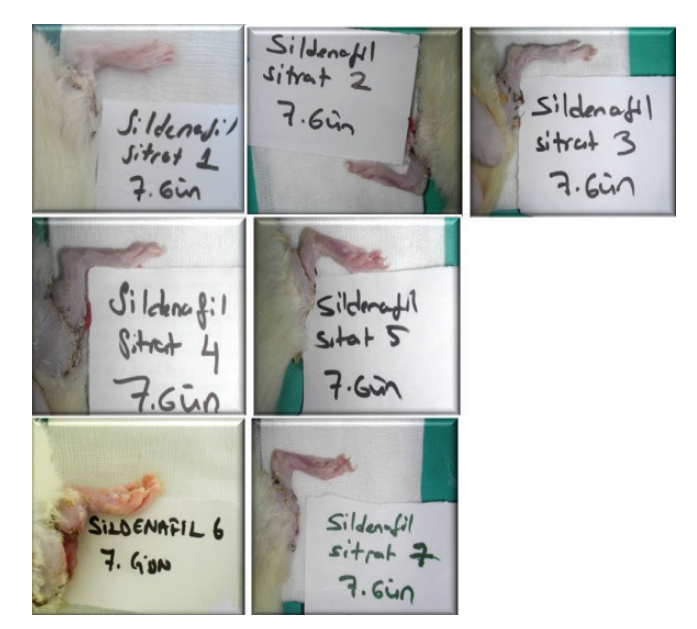
Figure 3. Macroscopic view of the sildenafil citrate group.

For VEGF immune-staining of femoral vein samples, moderate