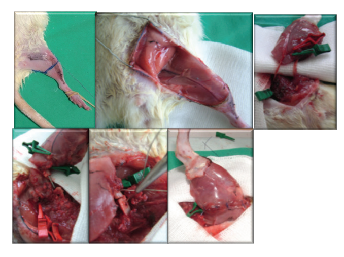
Figure 1. Surgical steps of the first part of the study. Femoral and sciatic nerves remained intact.

that could arise during the follow-up period. The control group (n=7) received 1 cc of saline and the study group (n=7) received 10mg/kg sildenafil citrate intraperitoneally immediately after amputation (Figure 1).