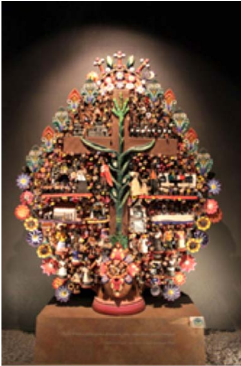
Figure 3: Tree of Life candelabrum with peacock; Mexican Museum of Anthropology. [Figura 3: Candelabro de Árvore da Vida com pavão; Museu Mexicano de Antropologia.]