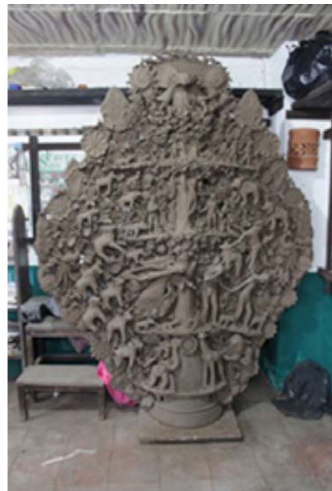
Figure 6: Noah's Ark themed Tree of Life. [Figura 6: Árvore da Vida com tema de Arca de Noé.]