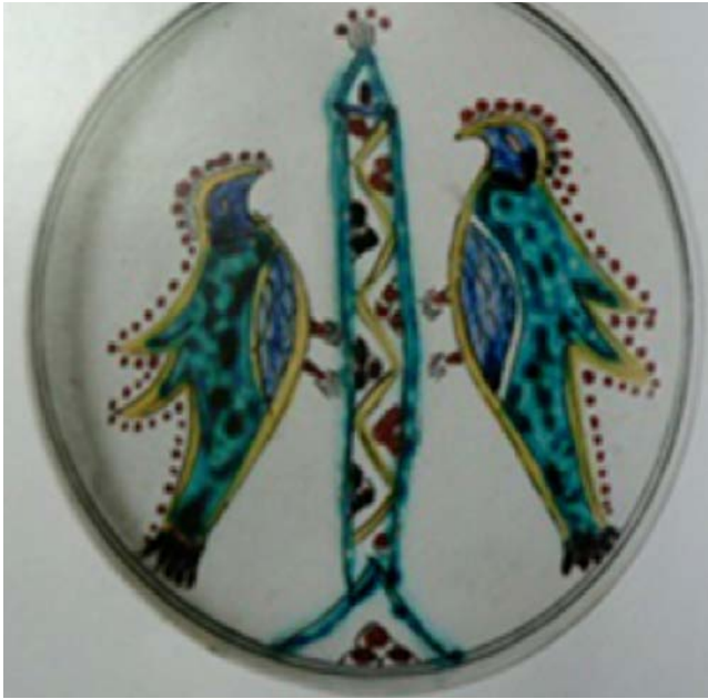
Figure 10: Pattern of tree in china plate made in Kütahya [7]. [Figura 10: Padrão de árvore em placa cerâmica produzida em Kütahya [7].]