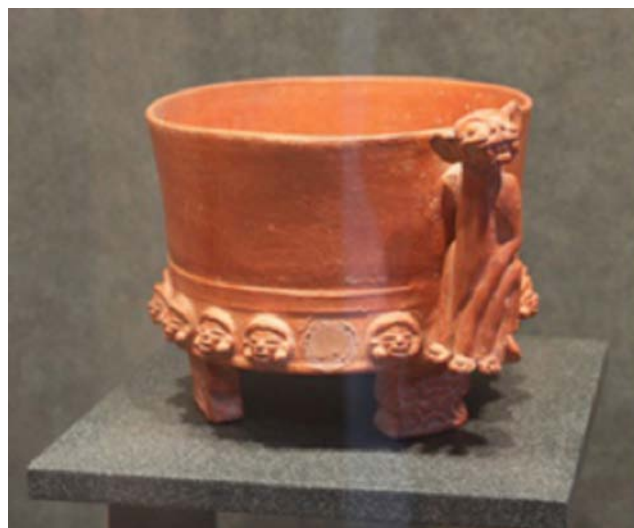
Figure 2: Maya ceramics, terra sigillata; Mexican Museum of Anthropology.

things at every moment. They are the richness of traditional hand crafts which shed light on today” [3]. Among the Mexican handcrafts which has a rich framework, pottery is one of the most popular and ancient field (Fig. 2). Mexican ceramics which is usually formed by using coil or moulding methods differs in the sense of form or ornaments according to the region they are produced. Metepec which is one of the most important centres of ceramics in Mexico continues to exist thanks to the originality of its ceramics.