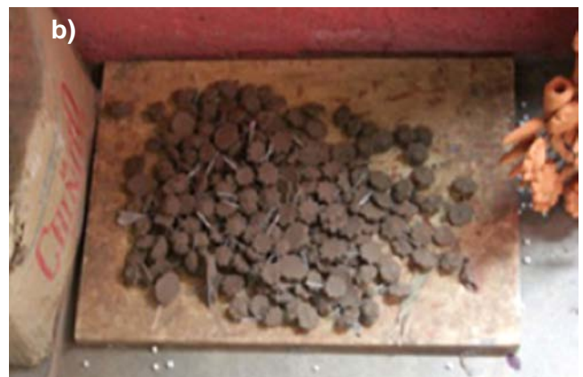
Figure 5: Flower figure (a) and details (b) for assembly on the tree of life. [Figura 5: Figura de flor (a) e detalhes (b) para montagem sobre a árvore da vida.]