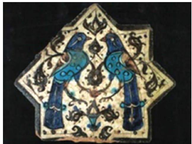
Figure 9: Example of china tile in Kubad Abad Palace [9]. [Figura 9: Exemplo de ladrilho cerâmico em Kubad Abad Palace [9].]

The tree of life pattern which was used in mosques, Moslem theological schools, palaces and handcrafts Seljuk and Ottoman arts has a rich and various expression. Like Oney [8] said, the figures of the tree of life like these in this rich expression of Anatolian Seljuk art can be categorized as: i) the tree of life represented on its own; ii) the tree of life surrounded by a pair of bird; iii) two headed eagle stood for a tree of life on an arabesque surface; iv) the tree of life represented as a whole and accompanied animals; v) symbolic explanation of the tree of life pattern (Figs. 9 to 11). When the pattern of the tree of life in Turkish art of ceramics is analysed, it is seen that it was used as an architectural element on china tiles in Seljuk art, as a decorative element on plates and functional three dimensional forms in Kutahya and Iznik chinas.