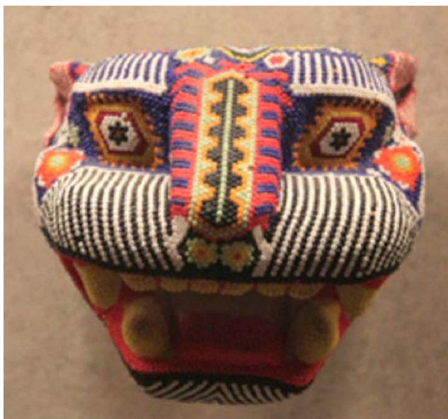
Figure 1: Example of Mexican handcrafts, bead braided Huichol; Mexican Museum of Anthropology.

[Figura 1: Exemplo de artesanato mexicano, cordão trançado Huichol; Museu Mexicano de Antropologia.]