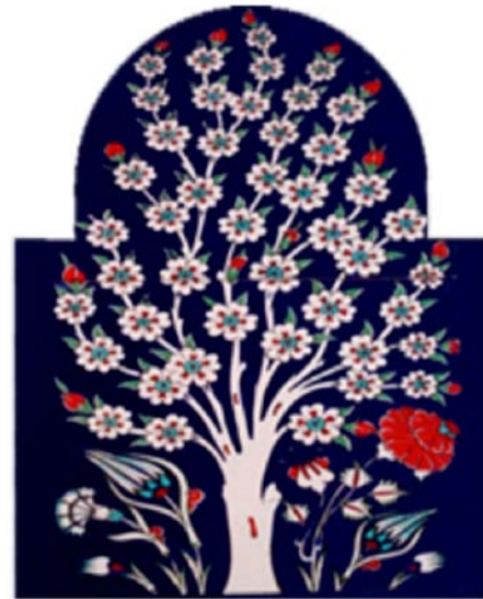
Figure 11: Turkish bath tile (80 cm x 100 cm), contemporary work in china production studio in Kütahya [10]. [Figura 11: Azulejo de banho turco (80 cm x 100 cm), trabalho contemporâneo em ateliê de produção de cerâmica em Kütahya [10].]