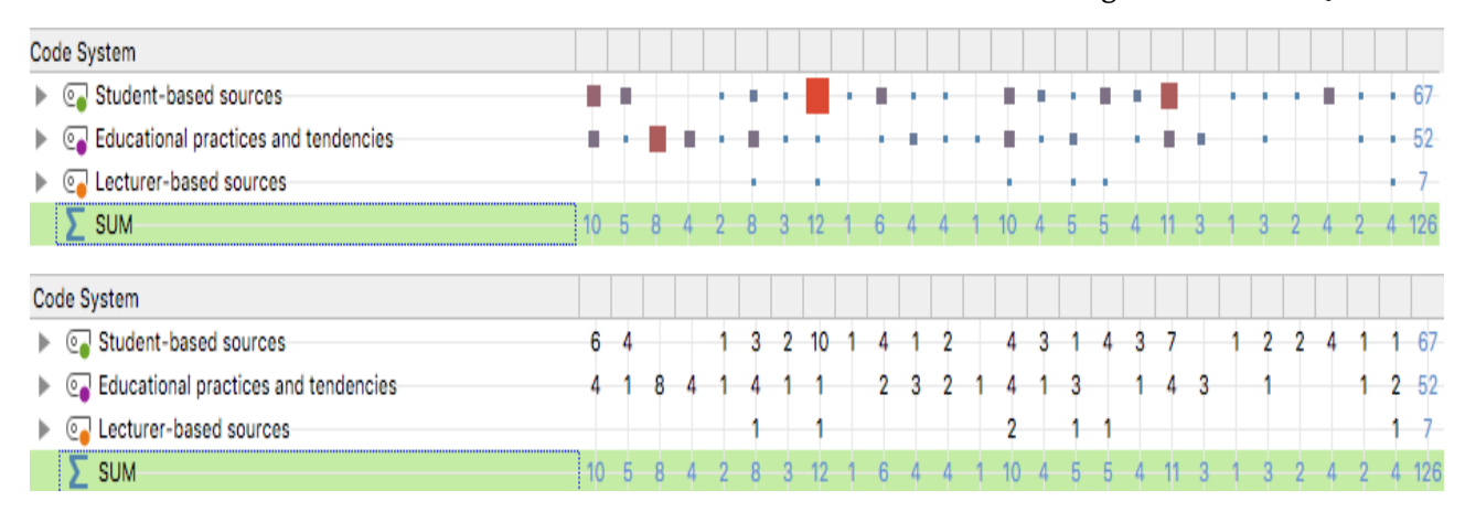
Table 2. The distribution of three main codes across 26 participants