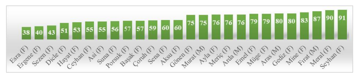
Figure 1. Writing exam scores of interviewees in an ascending order on the scale of 100

As for the RQ1, pre-service English teachers had been interviewed through the following question: " Do you think that students in our program have difficulty while writing in English ?". All the interviewees ( n =26) agreed that students in the program had difficulty while writing in L2.