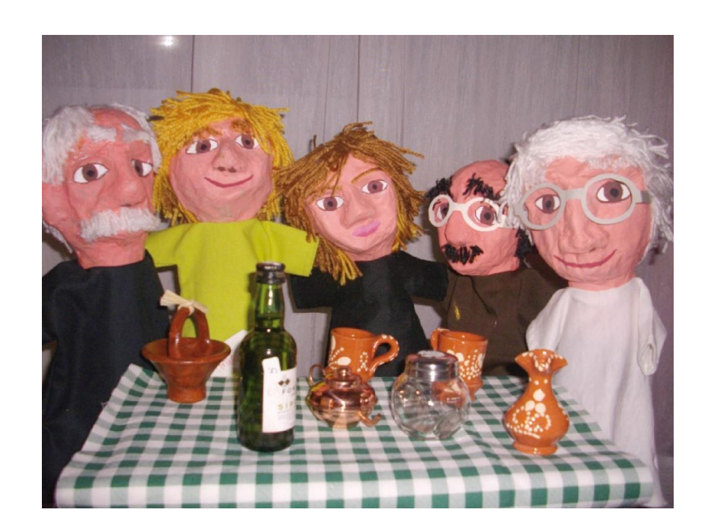
Figure 3: Puppets created by students at Escola EB 1,2 &3, Viana Do Castelo

his family and guests sit around a table sharing conversation, food and drink. The Portuguese national team used them to encourage students, aged 10-11, to reflect on the changing nature of family as an agent of socialization and how this influences citizen identity. (One reason the paintings are relevant for this theme is that children can compare what they see in them with their own family backgrounds. In so doing they may discover aspects of family life they can and cannot associate with). The teachers concerned drew on postmodern critiques that problematize mythical and stereotypical representations of childhood and family relations to challenge the students internalised conceptions of normal family life and awareness of multiple viewpoints. Moura and Sá's case study (2013) explains how this scheme unfolded.