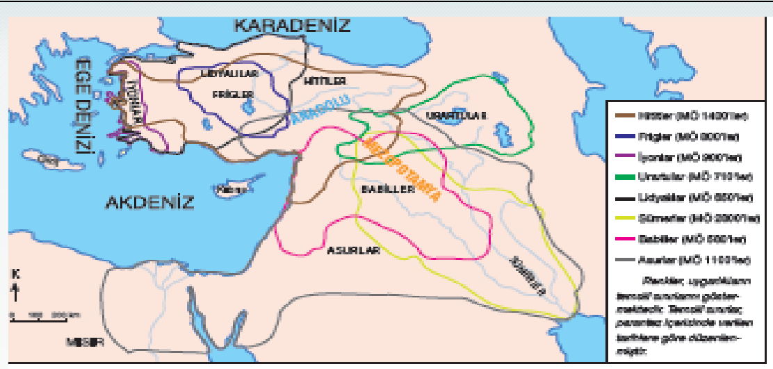
Elbay, S. (2020). A Foundational Perspective for Spatial Thinking in Relation to Social Studies...