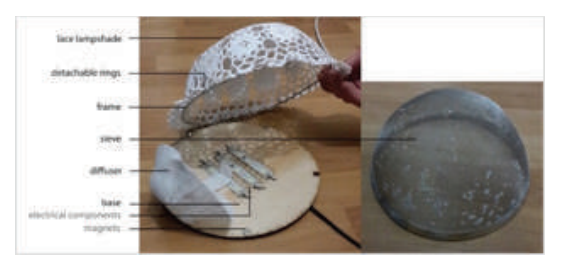
Figure 2. The components of the lace lamp, 2016.