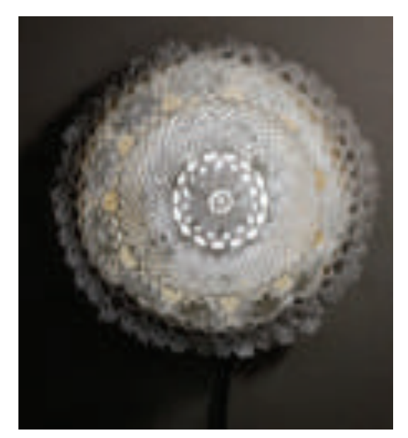
Figure 1. Lace Lamp, 2016.

The electrical components (LEDs, switch, plug and cabling) are produced at the mass production level; the base, the hemispherical sieve, the frame and the diffuser are manufactured at the batch production scale, and the detachable rings are made with craft production (Figure 2).