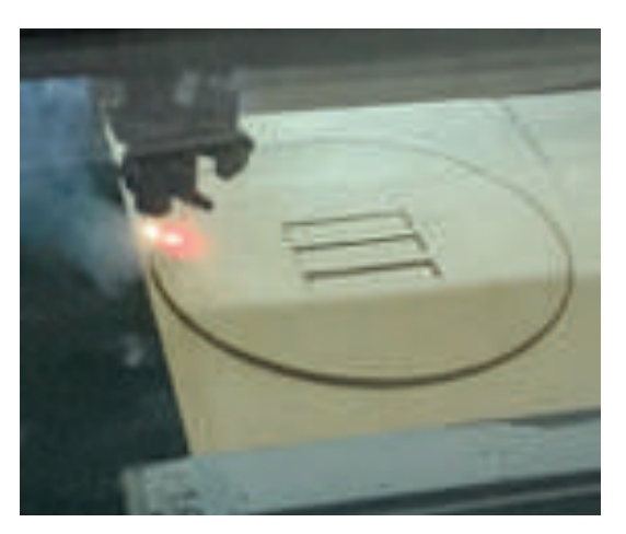
Figure 3. The manufacturing process of the wooden base, 2016.

Lace lampshade as the DIY part: The sieve is a part of the design kit to serve users for obtaining the lampshade from the lace. To put the lace into a hemispherical shape and maintain it, the user can use PVA glue or produce the fixing mixture using natural ingredients. Deciding on the qualities of raw materials of the yarns for lacing and making natural adhesives such as homemade glue to raw materials of the yarns for lacing and making natural adhesives such as homemade glue to practically shape them into hemispherical shades required some trial-and-error to arrive at a practical solution. To make the lace tough enough to keep its shape after being treated with glue, testing with threads having different fibre compound percentiles and different measures